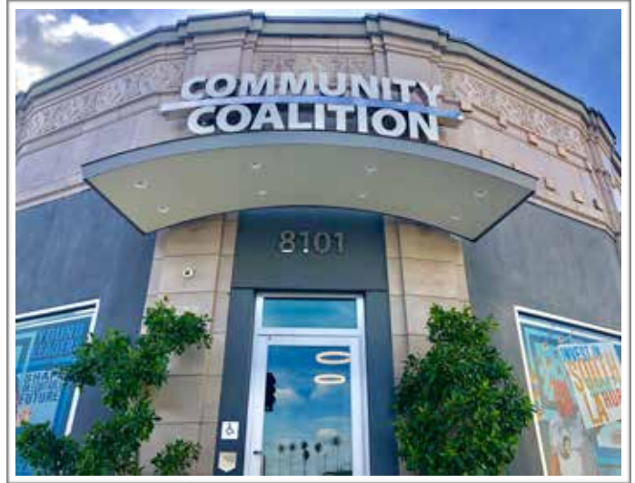
8101 S. Vermont Avenue at the corner of 81st & Vermont

For 30 years, Community Coalition has been led by community members who have stepped up to win key campaigns in education, justice reform, and land use policies. In 1990, a group of community activists huddled together in a living room in South LA. Gathered by Community Coalition's (CoCo's) founder and current Congressmember Karen Bass, the group was haunted by the raging health crisis that had enveloped their community. The daily impacts of the crack cocaine epidemic were devastating and the city's only response was to criminalize our community. It was particularly cruel given that in the previous decade, corporations had moved over 300 manufacturing plants out of South LA for cheaper labor costs overseas and the Reagan Administration had dismantled the social safety net, severely undercutting economic stability. The activists knew that criminalizing addiction would only make matters worse. They believed that South LA residents most impacted by the crisis should be included in creating real solutions for their community. It was from this vision that the idea of a community-driven organization was born.